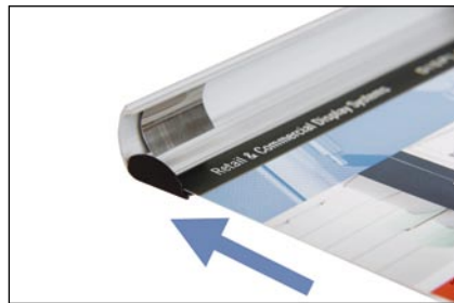
^ POSTERSNAPPER™ IS AVAILABLE TO SUIT A RANGE OF STANDARD PRINT SIZES OR CAN BE SUPPLIED IN CUSTOM SIZED PROFILE LENGTHS TO SUIT SPECIALISED REQUIREMENTS