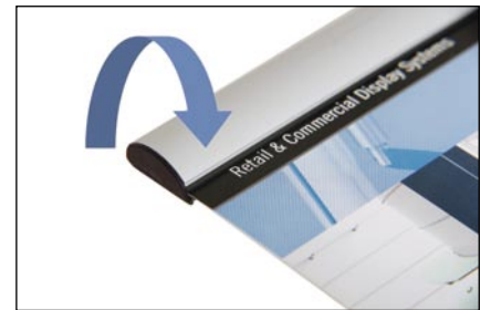
^ POSTERSNAPPER'S™ INNOVATIVE CLIP PROFILE SECURES IMAGES INTO PLACE. PROFILES CAN BE DIRECTLY WALL MOUNTED OR CEILING SUSPENDED