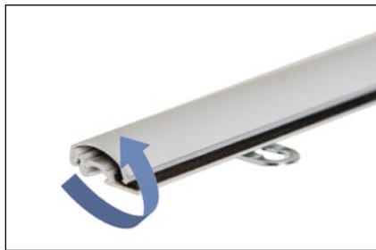
^ EACH POSTERSNAPPER™ SET CONTAINS 2 X 25MM CLIP PROFILES, 4 X BLACK PLASTIC END CAPS AND 2 X METAL HANGING LOOPS

POSTERSNAPPER™ profiles are available to suit print sizes A0-A4 or alternatively, can be ordered in custom sizes up to 1000mmL.